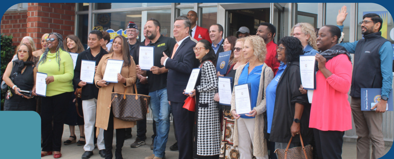
Below: The East County Chamber of Commerce and Mi-Box San Diego hosted a Grant Recipient Appreciation Event to express their gratitude.